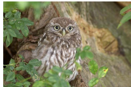
Photo by kind permission and copyright of Kevin Lewis. View his superb photos on http://www.thelewiss.co.uk/gallery2/main.php?g2_itemId=8

The little owl ( Athene noctua ) was introduced into this country from Holland in the 1880s. As the Latin names implies, it was the owl associated with the Greek goddess of wisdom, Athene. It's not much bigger than a blackbird; it feeds on small mammals and birds, beetles and worms. It likes lowland farmland with hedges and copses, parkland and orchards and is most common in central, southern and south-eastern England, and the Welsh borders. Hunting is carried out at dusk and dawn but it can be seen in daytime, too, often perching on a fence post. Assessing numbers of little owls is difficult because of their hunting times, but there are varying calculations of 7,000 to 9,000 UK breeding pairs. It's present in Berkshire, and with luck it can be seen locally, or heard calling. The little owl is included in a listing of birds at Dinton Pastures. In 2007 it is recorded as being regularly heard calling around Woodley airfield estate, towards the ader Way area.