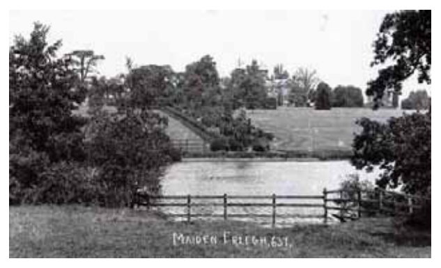
(Maiden Erlegh House can just be seen in the distance)

There were nine other children of my age who lived in Salcombe Drive. Some were refugees from London like me. We used to gather up and go to school together under the supervision of a mother or two. We soon formed a gang which played out in the road in the light evenings