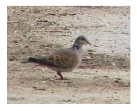
The vanishing turtle dove

the forest elephant, which is being killed at an alarming rate.