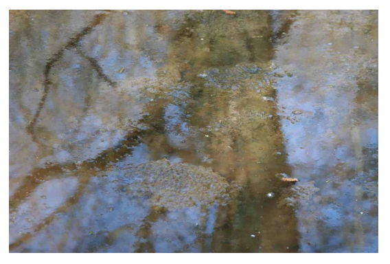
Above: Frogspawn in Old Pond Copse, Maiden Erlegh Nature Reserve, April 2006. Frogspawn noted in same pond Feb 29 2008.

A fascinating look at changes in nature can be found on www.naturescalendar.org.uk