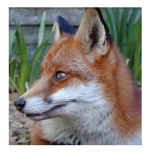
Fox head - value 12d

The parish bounty hunters had to present the heads of the kill for payment to 'two honest and substantial persons', elected annually.