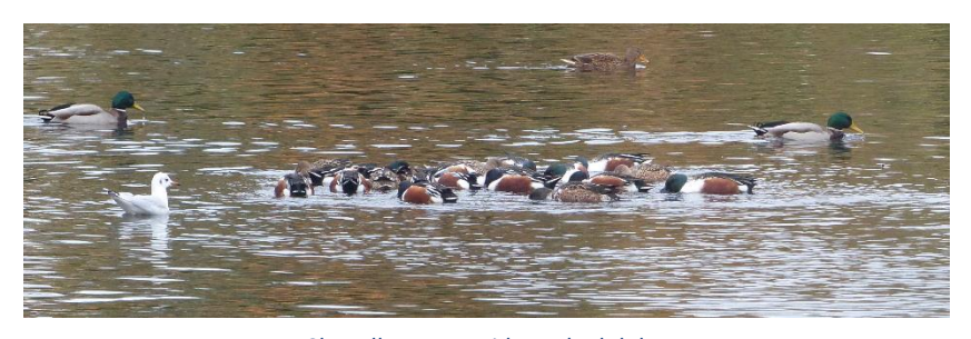
Shovellers on Maiden Erlegh lake. Note the different body colouration from the Mallards behind.

It's a sure sign that winter is on its way when the Shovellers arrive on Maiden Erlegh lake. These birds have taken to overwintering in Earley for the last few years: interesting choice! They have this amazing