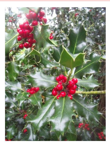
Seasonal photo that didn't make it into the EEG calendar. By Edwin Trout

Earley - Old English 'Earnley' = eagle wood