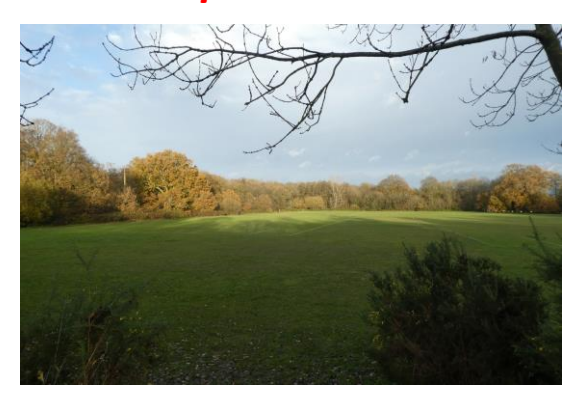
Laurel Park Lower Field, site of proposed all-weather pitch

On flood risk, the assigned contractors would need to put provisions in place to reduce any impact on the surrounding area.