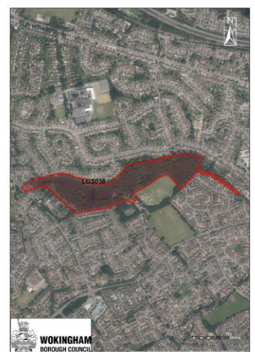
Maiden Erlegh LNR As in the Local Green Space submisssion

The EEG has had a welcome success with its proposals for Local Green Space designations in Earley. In June 2020, the EEG submitted 14 proposals for Local Green Space designation under Wokingham Borough Council's (WBC) Draft Local Plan Update consultation. We are pleased to