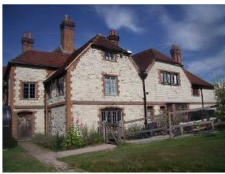
Left: the later museum wing. Right: the original house