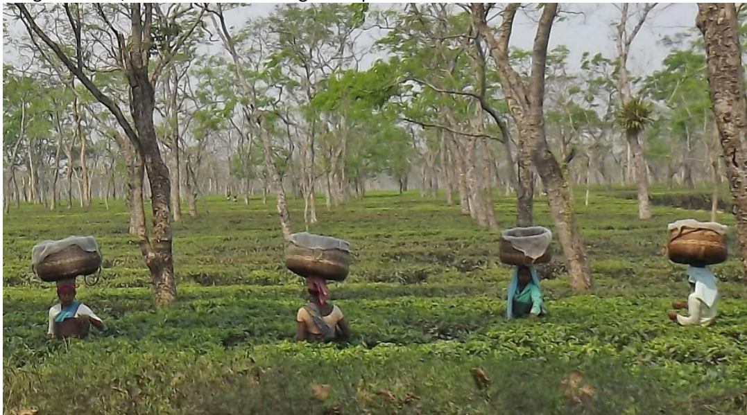
Tea pickers in Assam (Assam tea is grown at sea level).

The story of our daily cuppa is probably unknown to most people, but you couldn't make it up. Tea brought great wealth to Britain and various individuals. A big player in the story was the East India Company, the first great multinational corporation, with its shameful part in plundering India and creating a multitude of opium addicts in China, bringing China to its knees by a two-way trade of opium and tea, with resultant Opium Wars. A central player in the narrative was Scots-born Robert Fortune, the famous plant-hunter, who travelled for several years in China's interior. Astonishingly, he was born into a poor family and was mostly self-educated, finally achieving a post at the prestigious Horticultural Society in Chiswick. He was first commissioned in 1843 by the Horticultural Society of London to undertake a 3-year plant-collecting expedition in China, there being an increased interest in gardening in Britain, and over 200 of our garden plants owe their existence to him.